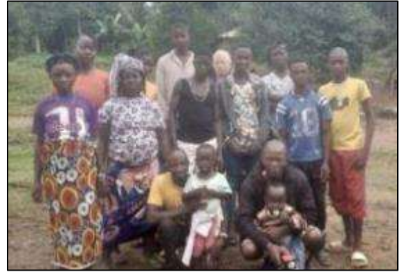
A recent congregation started too, yet they worship in a house.