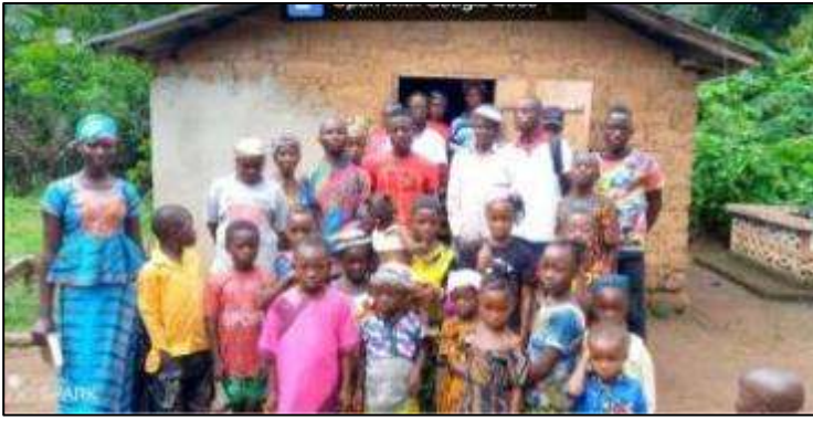
Establishment of new congregations and the strengthening of the existing ones is ongoing.