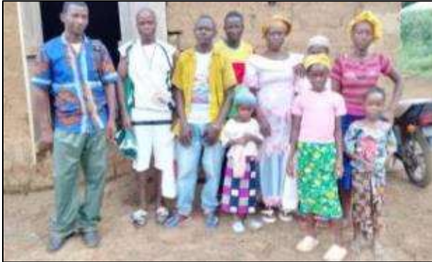
A visit across the country in Guinea was to see how we could help in evangelism.