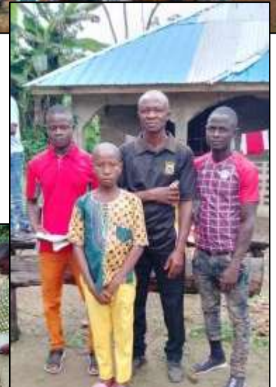
During the day preaching, tracts are being shared with those interested.